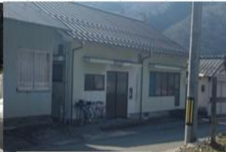
Control Point(7) 油木地区老人集会所