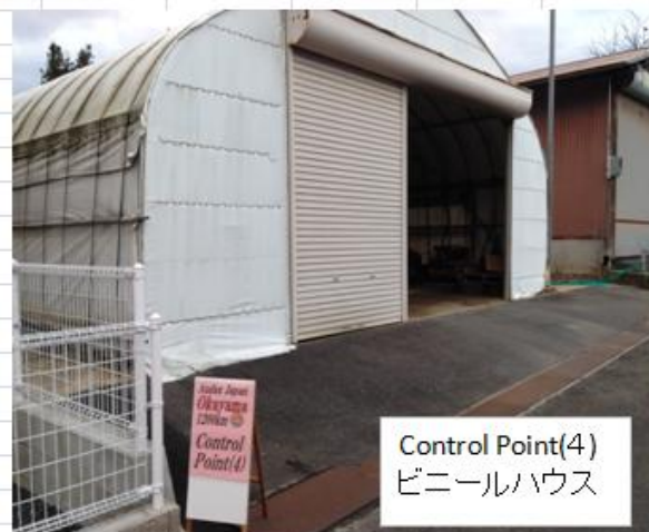
Control Point(4) ビニールハウス