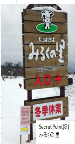
Secret Point(3) みづの里