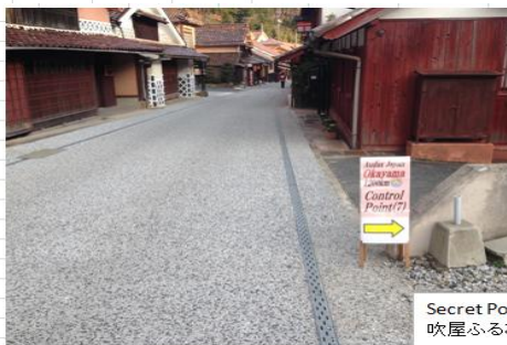
Secret Point(7) 吹屋ふるさと村