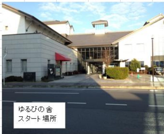
ゆるびの舎 スタート 場所