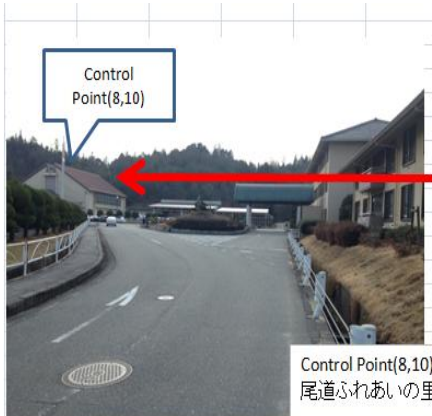
Control Point(8,10) 尾道ふれあいの里