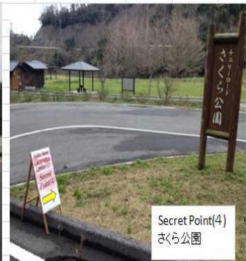
Secret Point(4) さくら公園