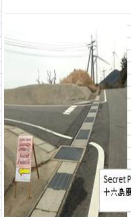
Secret Point(5) 十六島風車公園