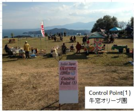
Control Point(1) 牛窓オリーブ園