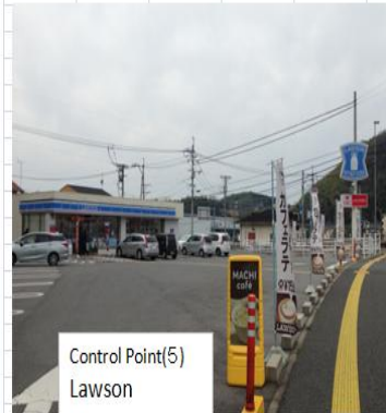
Control Point(5) Lawson