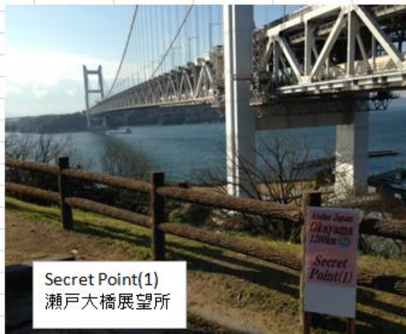
Secret Point(1) 瀬戸大橋展望所