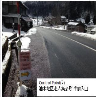
Control Point(7) 油木地区老人集会所 手前入口