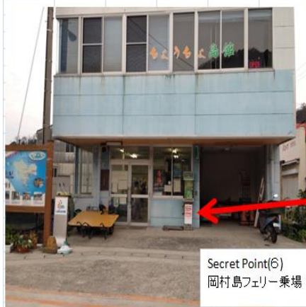
Secret Point(6) 岡村島フェリー乗場