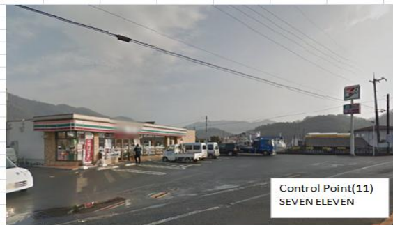
Control Point(11) SEVEN ELEVEN