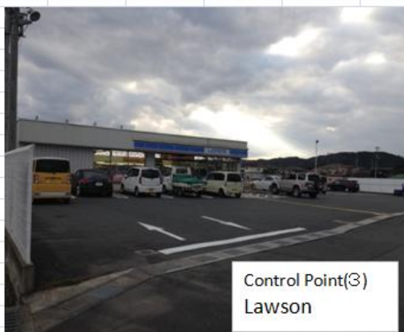
Control Point(3) Lawson