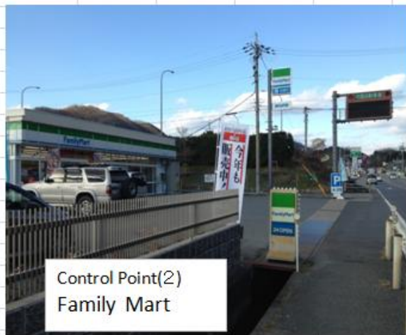
Control Point(2) Family Mart