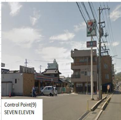
Control Point(9) SEVEN ELEVEN