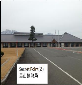
Secret Point(2) 蒜山振興局